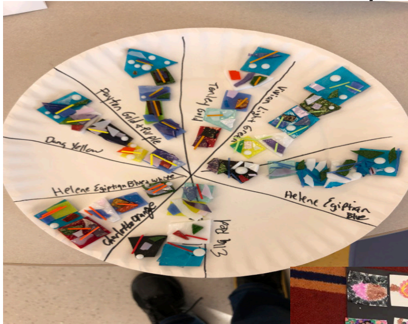
Fused Glass & Amazing Art